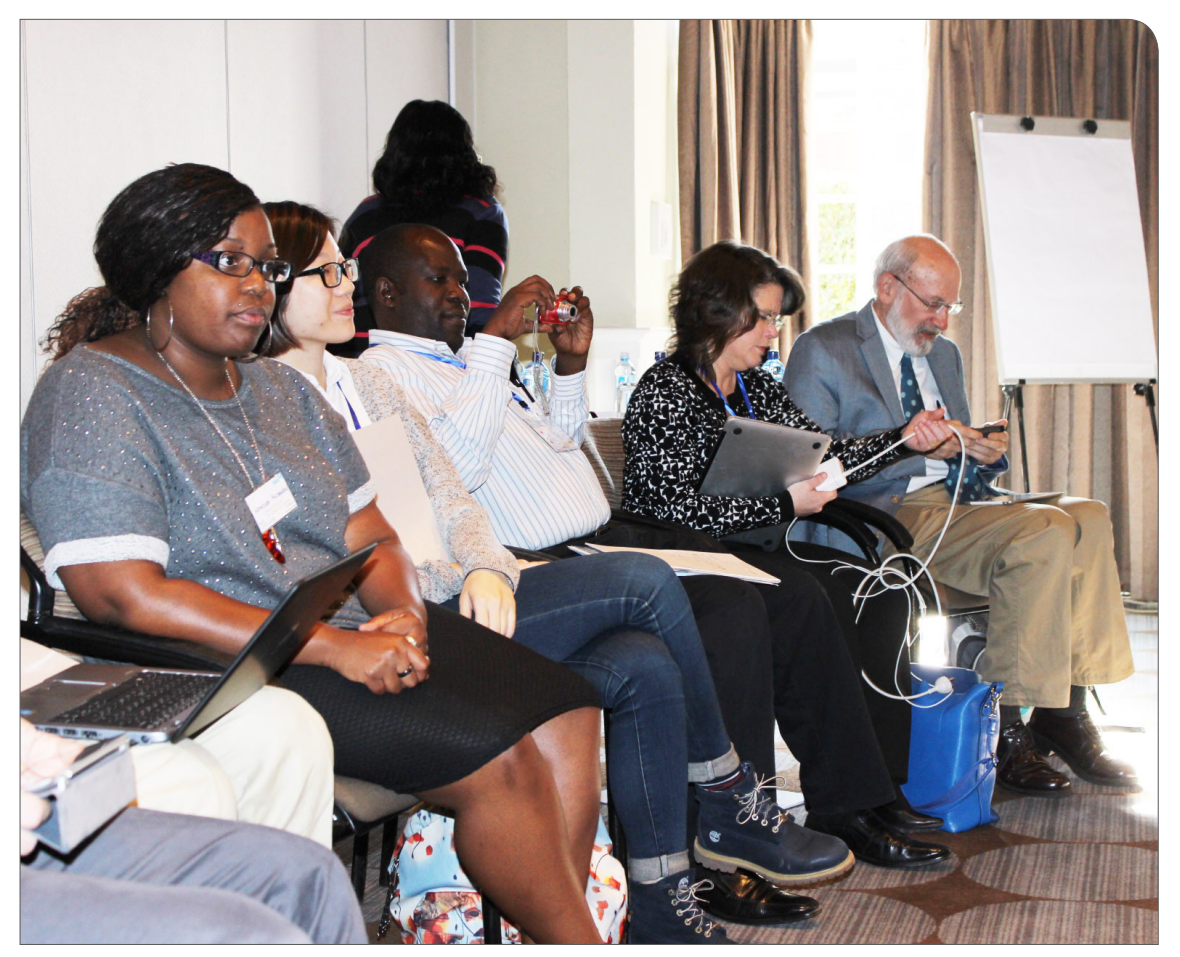
Participants at the training exchange session. 17 different training sessions were offered to participants.

In total, this represents 52 hours of training . And with 100 registered attendees, that is the equivalent of roughly 5,000 hours of total training received (subtracting out trainers' time). List of trainings offered is in Table 1.