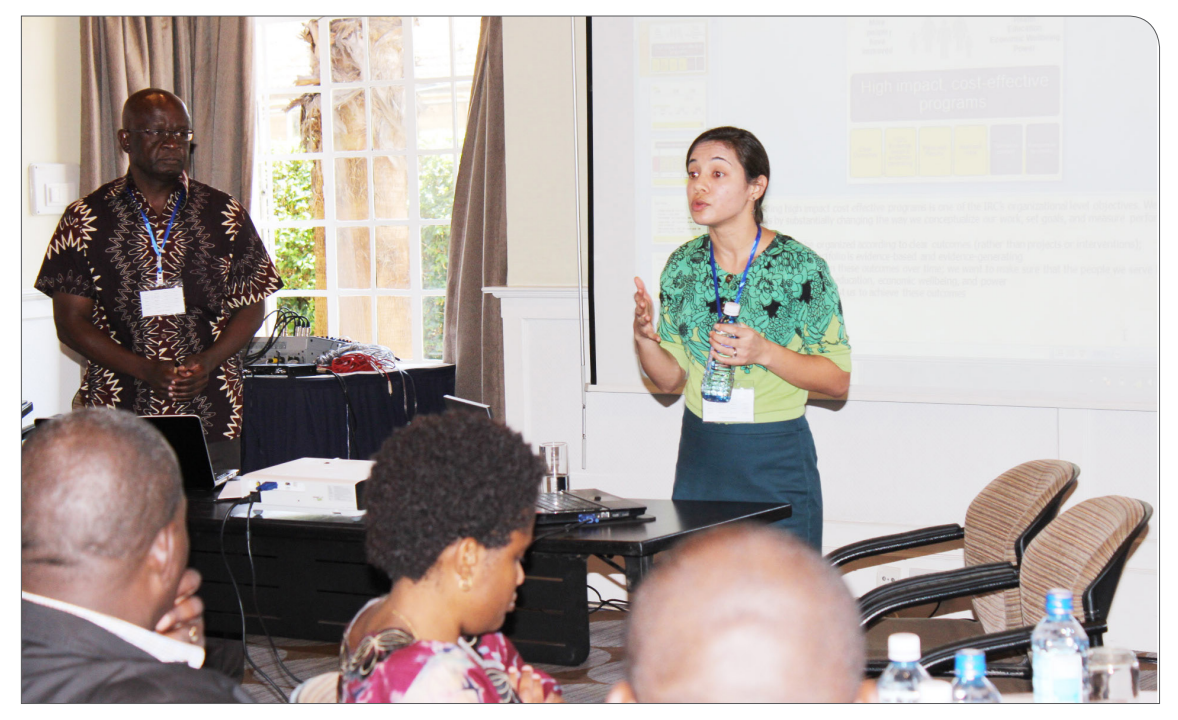
A speaker presents findings during the Strengthening Capacity for Research Uptake session on February 9, 2015

The self-assessment tool, launched at this event, has proved popular. More information about the tool and how to facilitate the assessment is available on the <u>LANSA website</u>.