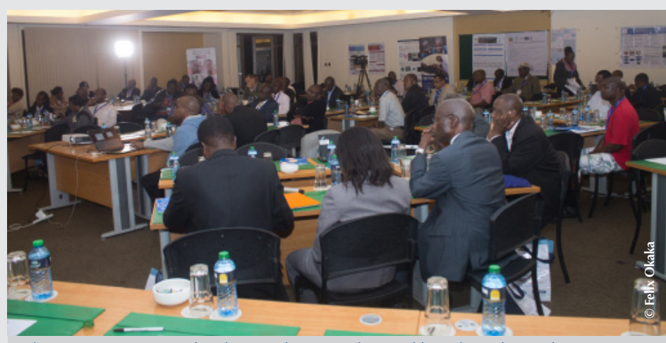
Adequate training on use of evidence in decision-making enables policymakers make more