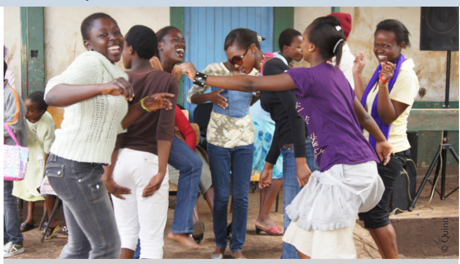
Adolescents are a vulnerable population as adolescence is a period of self-discovery requiring special attention and guidance.