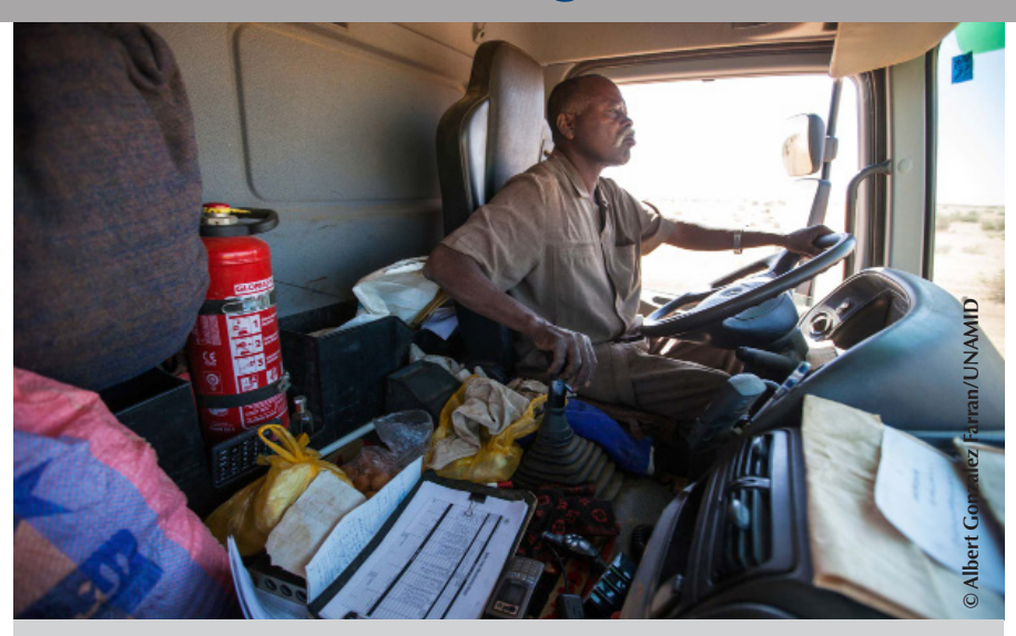
Truck drivers are among key populations who are at increased risk of acquiring or transmitting HIV/AIDS.