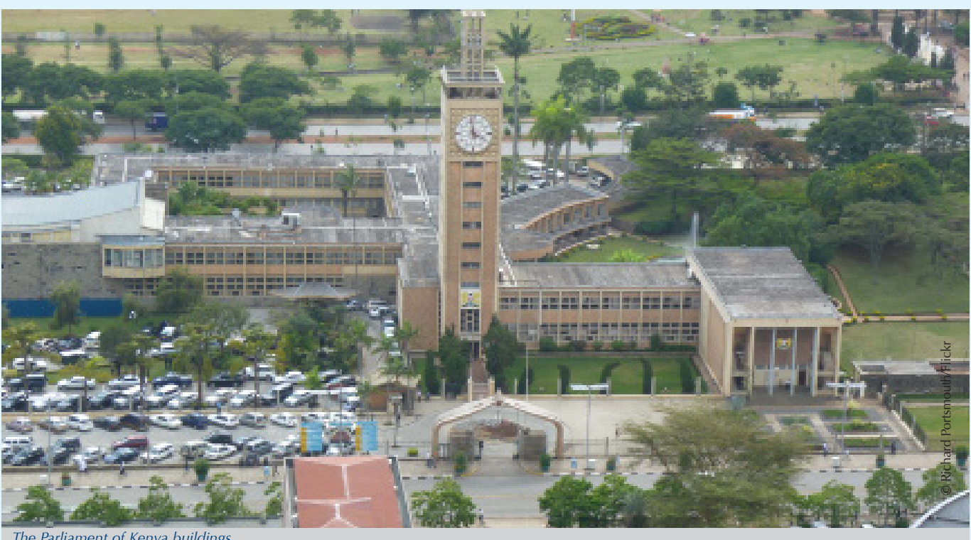
The Parliament of Kenya buildings.