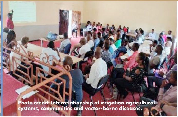
Photo credit: Interrelationship of irrigation agricultural systems, communities and vector-borne diseases.