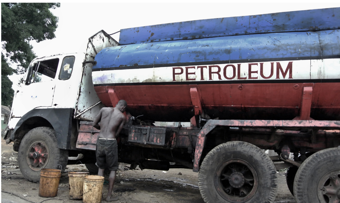
A Kenyan truck driver.