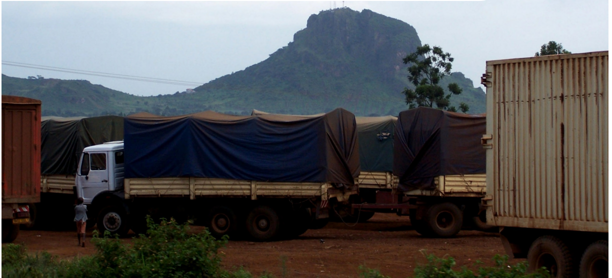
Trucks near the border of Kenya and Uganda north of Lake Victoria.