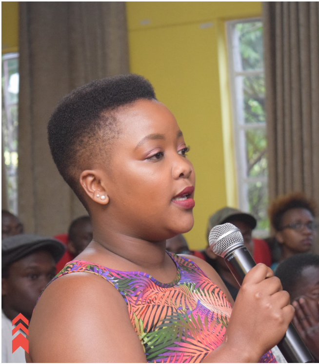
An audience member speaking during a science-policy café dedicated to highlighting the role of evidence in driving Kenya's development aspirations and how investments in youth can transform Kenya's socio-economic landscape. This was the first of two cafés held in January 2018 at PAWA 254 in Nairobi.