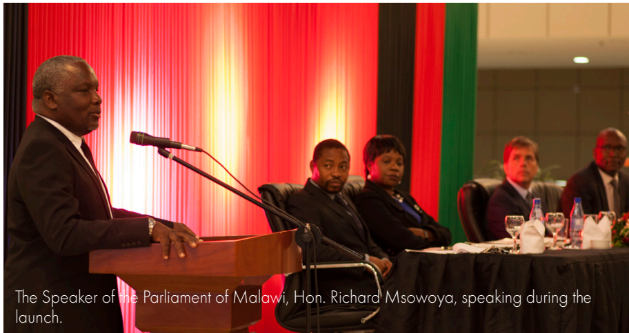
The Speaker of the Parliament of Malawi, Hon. Richard Msowoya, speaking during the launch.

On 28 February 2018, the Parliament of Malawi launched a new project aiming to improve its performance. The new project – the Malawi Parliament Enhancement Project (MPEP), aims to stimulate reforms to improve the effectiveness and impact of parliament in steering democracy, upholding good governance, and promoting socio-economic development in Malawi.