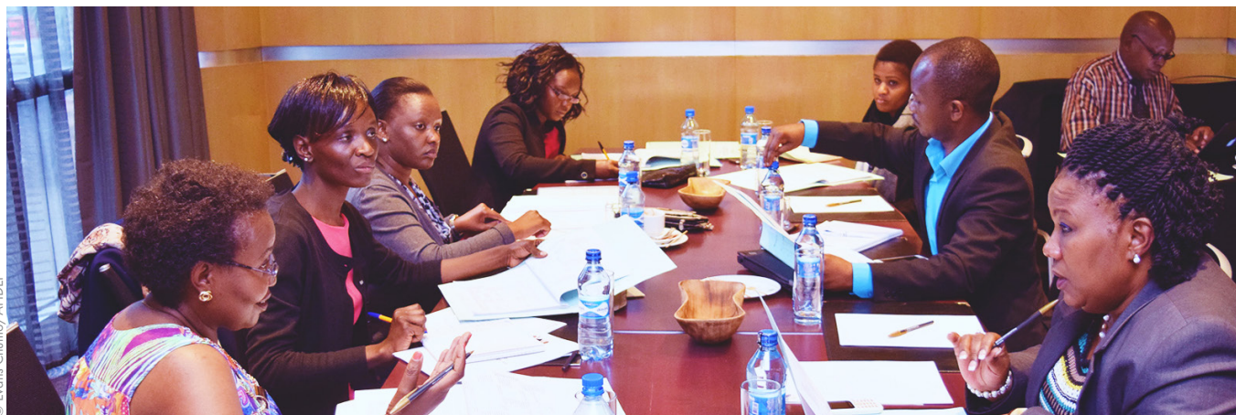
Some of the members of the Parliamentary Caucus for Evidence Use in Decision-making, with members of staff from the Parliamentary Research Services and AFIDEP during a planning meeting for the Caucus' activities in late 2016