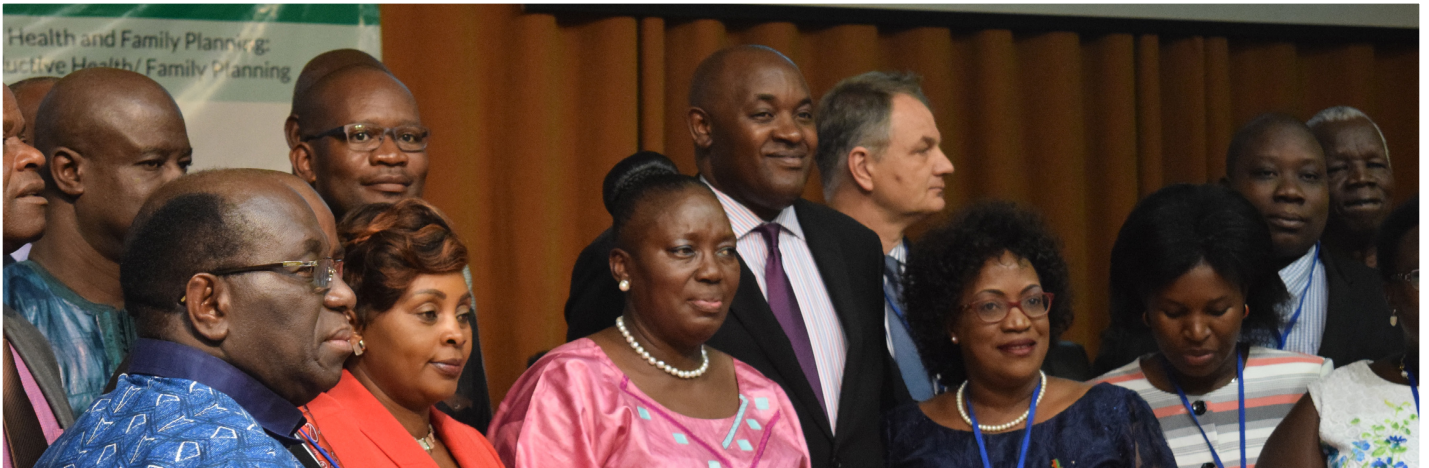
Members of parliamentary committees of health from various African parliaments pose for a photo with the Uganda Speaker of Parliament, Rt. Hon. Rebecca Kadaga (centre) during the opening of the 2017 annual NEAPACOH forum, in Munyonyo, Uganda