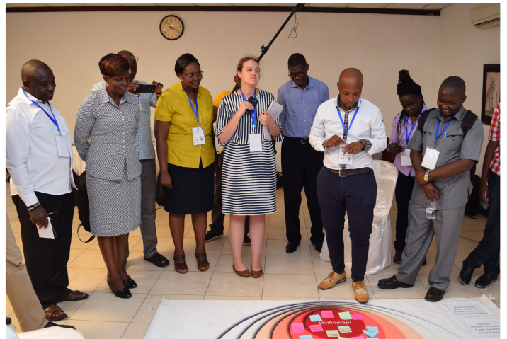
Participants at a workshop on communicating the demographic dividend in Dar es Salaam, Tanzania (4-5 October 2017). The workshop was part of a project seeking to recruit key influencers to communicate and advocate on issues related to one or more of the four pillars of the demographic dividend