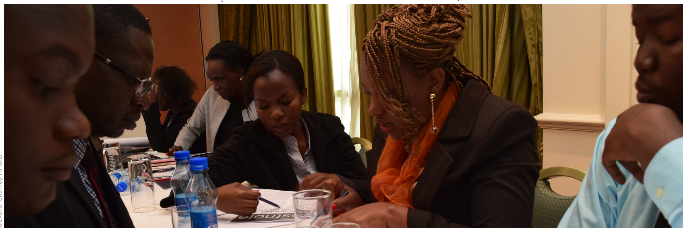
Staff of the Parliamentary Research Service, which provides research support in policy development to the Kenya Parliament, during a past workshop on evidence use in Nairobi

This example demonstrates the importance of technical staff who have the requisite knowledge and skills in improving the performance of parliaments in Africa. As parliaments in Africa continue to implement efforts to improve their performance, we hope that they will prioritise the institutional systems and structures they have put in place to enable access to, and use of, information and technical advice in parliamentary debate and decision-making. Some parliaments, such as Uganda and Kenya, are setting the pace in this area, and it will be great if more African parliaments can follow in the footsteps or even do better.