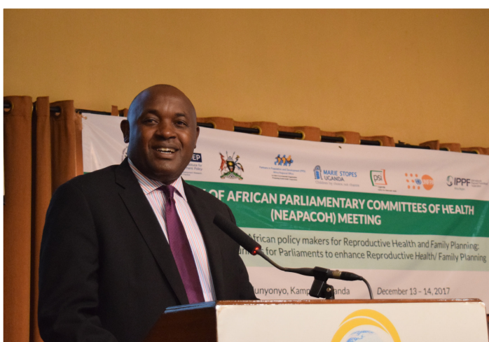
Hon. Dr. Chris Baryomunsi, MP, Uganda Parliament and Minister of Housing and Urban Development, gives the keynote address at the opening of the NEAPACOH 2017 forum