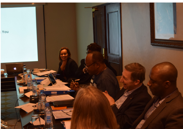
A section of the members of AFIDEP's Board of Directors enjoying a hearty moment during a board meeting in Nairobi in November 2017