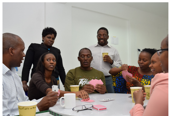
AFIDEP Nairobi members of staff playing a round of cards during a "Happy Hour"-themed staff party in Nairobi - July 2017